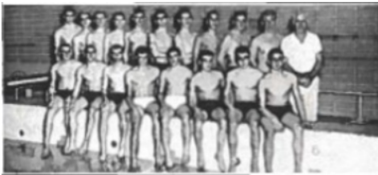
1959 & 1960 Freestyle Swim Team

The inductees and presenters at the May 4, 2024 induction ceremony include: